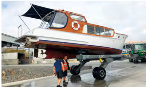
Tamaki Marine Park has two haul-out trailers ready to haul your boat out of the water.

Boat owners are welcome to drop their boats off at their convenience. Boat owners can even take advantage of a free drop off berth on a Sunday night or the day before haul-out, dropping their boat off ready to be hauled out