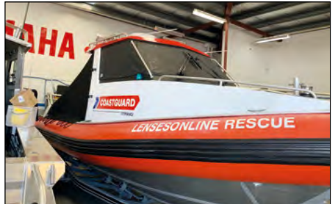
Five months after it was damaged by a landslide, Coastguard's LensesOnline Rescue is nearly ready to go back in the water.

The past few months have been demanding for our small unit, but the outpouring of support from the community has been truly heart-warming. We are grateful for all the assistance we have received, which has played a crucial role in getting us back on the water and serving our community once again.