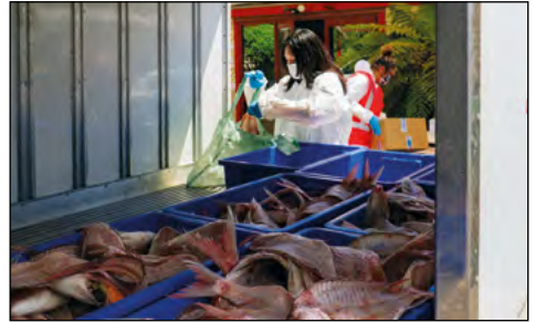
More than 340,000kg of fish parts have been distributed by the Kai Ika Project since 2016.

While our team continues to advocate for a ban on bottom trawling and other industrial fishing methods devaluing our fish, the Kai Ika Project addresses