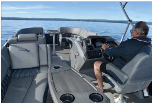
Floor plan and seating options mean there's a Bennington 25 QSB for everyone

Bennington's bold, forward-thinking design puts the pontoon boat on a whole new level of acceptance. It combines the best of a pontoon boat and the most coveted attributes of a fibreglass bowrider. Graig admits that it will take some time