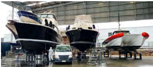
Undercover hardstand storage options are also available.

Tamaki Marine Park's informative website can be found www.tamakimarinepark.co.nz , or you can check it out on Facebook and Instagram.