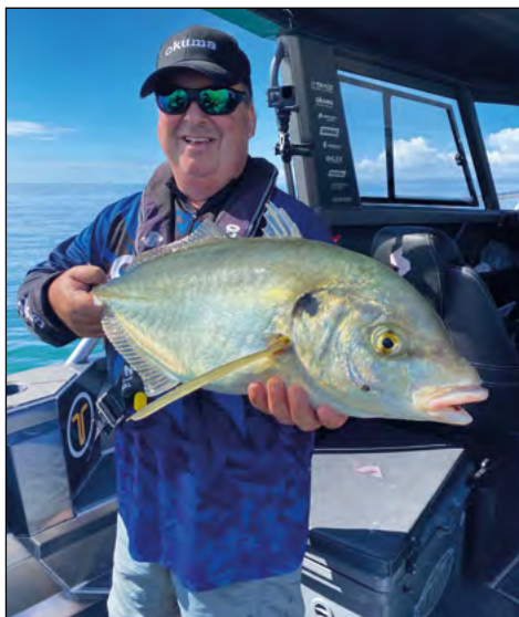
Hard fighting trevally can be found around structure in winter.