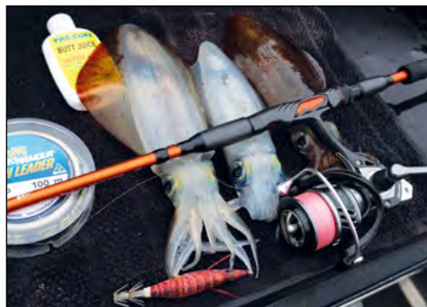
Squid fishing is good in winter and squid make great fresh bait or delicious dinner.

Winter is an excellent time to target gurnard and trevally. They often inhabit sandy or muddy areas, so focus your efforts near coastal beaches, sandbanks, or shellfish beds. These species are prolific in the west coast harbours like the Manukau and Kaipara. Oily salted bonito, squid, or pilchard fillet baits work well when presented on a flasher or dropper rig. Gurnard and trevally are attracted to scent and burley. Create a burley trail by periodically dropping small amounts of chopped pilchards or shellfish into the water near your fishing spot, to