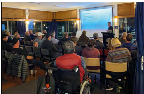
Around 130 people attended the Bluefin Tuna Talk over the two nights.

The evening concluded with everyone feeling much more confident (or at least, hopeful) that their next mission would be a success!