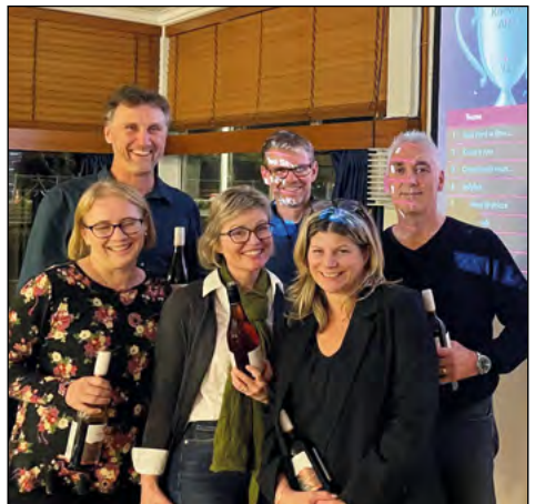
Team Row Hard or Row Home took out the May Quiz Night challenge.

A great night and a tight chase saw victory at the OBC's May Quiz Night come down to a tie-breaker. Eleven teams took up the challenge of the quiz, which is run under the popular interactive Believe It or Not format. After eight rounds of questions, plus bonus-point rounds, both team 'Row Hard or Row Home' and team 'Know It Ales' were sitting at the top with 92 points apiece. With some quick thinking, Row Hard or Row Home took the win and the spoils – a bottle of tasty liquid refreshment for each team member. Team 'Consistently Inconsistent' wasn't far off the top two, finishing the night with 89 points. The next Quiz Night will be held on